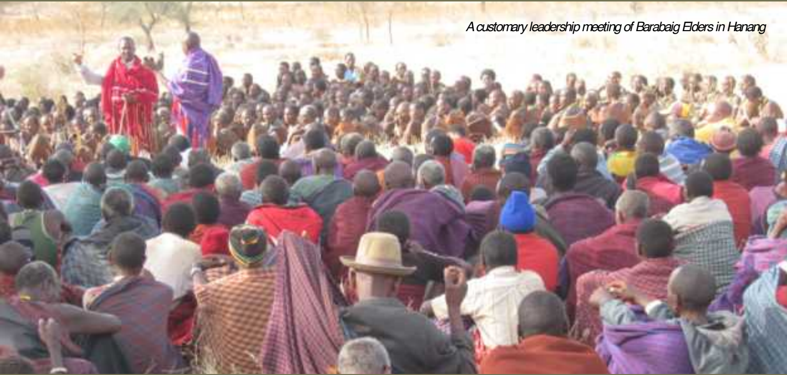
A customary leadership meeting of Barabaig Elders in Hanang