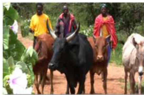
Batemi youth on the reopened road to Wasso market

Now, when there is a dispute between two villages the other villages stay out of the dispute, and instead work together through chosen representatives to mediate its resolution. Previously conflicts would escalate rapidly, as villages tended to side with their ethnic group; however, today this no longer happens. Boundary conflicts have been solved or nearly solved between six villages.