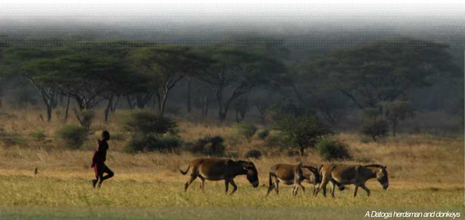
A Datoga herdsman and donkeys

The historical loss of land, together with increasing pressure from population growth within the Barabaig community and from immigration, together with competition over land between pastoralists and agriculturalists all add to the ongoing land and boundary conflicts in the area. UCRT has played an important role in enabling the Barabaig to reclaim some of their grazing lands. Yet despite some success, there remain unresolved issues and conflicts, and the returned land has yet to be fully demarcated, with more land still needing to be returned.