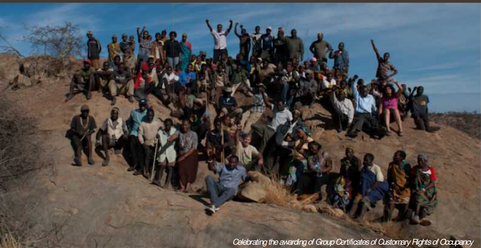
Celebrating the awarding of Group Certificates of Customary Rights of Occupancy