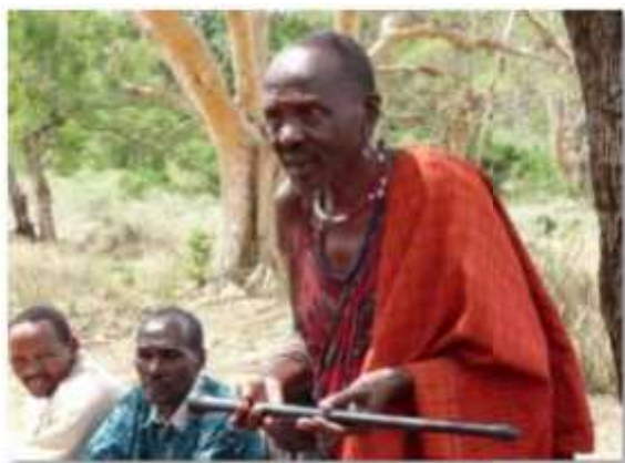
Oath taking was one of the strategies to end conflict and create peace

strategy for intervention - one that had not yet been tested – which was to form a joint council of elders for conflict resolution. This would help solve and de-escalate smaller conflicts over land that continued to break out, and that tended to escalate into heightened protracted violent conflict. It was agreed that in order to resolve any arising boundary or other localized conflict, two representatives from each village in the larger area - whether Batemi or Loita - would be chosen to mediate and make recommendations for its resolution. No representatives would be drawn from the villages involved in the dispute. The appointed conflict mediators would then be much freer to act fairly in their resolution of the conflict.