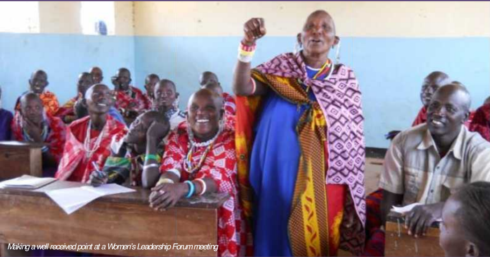
Making a well received point at a Women's Leadership Forum meeting