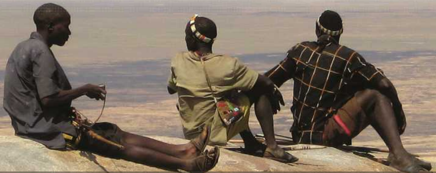
Hadzabe men from Mongo wa Mono Village looking out over their land

There is a great opportunity to share the experiences of empowering the hunter-gatherer and pastoralist communities in Yaeda: in order to do this UCRT would like to hold a large meeting with all three districts to share the successes of the work that has been done and to encourage other communities to do the same. Now that the land has protective boundaries more capacity building is needed for the Hadzabe communities and for their neighbours to ensure that everyone understands the area's boundaries and the meaning of the title. UCRT will continue to support the hunter-gathering, herding and farming communities of the Yaeda Valley to improve their collective management of their