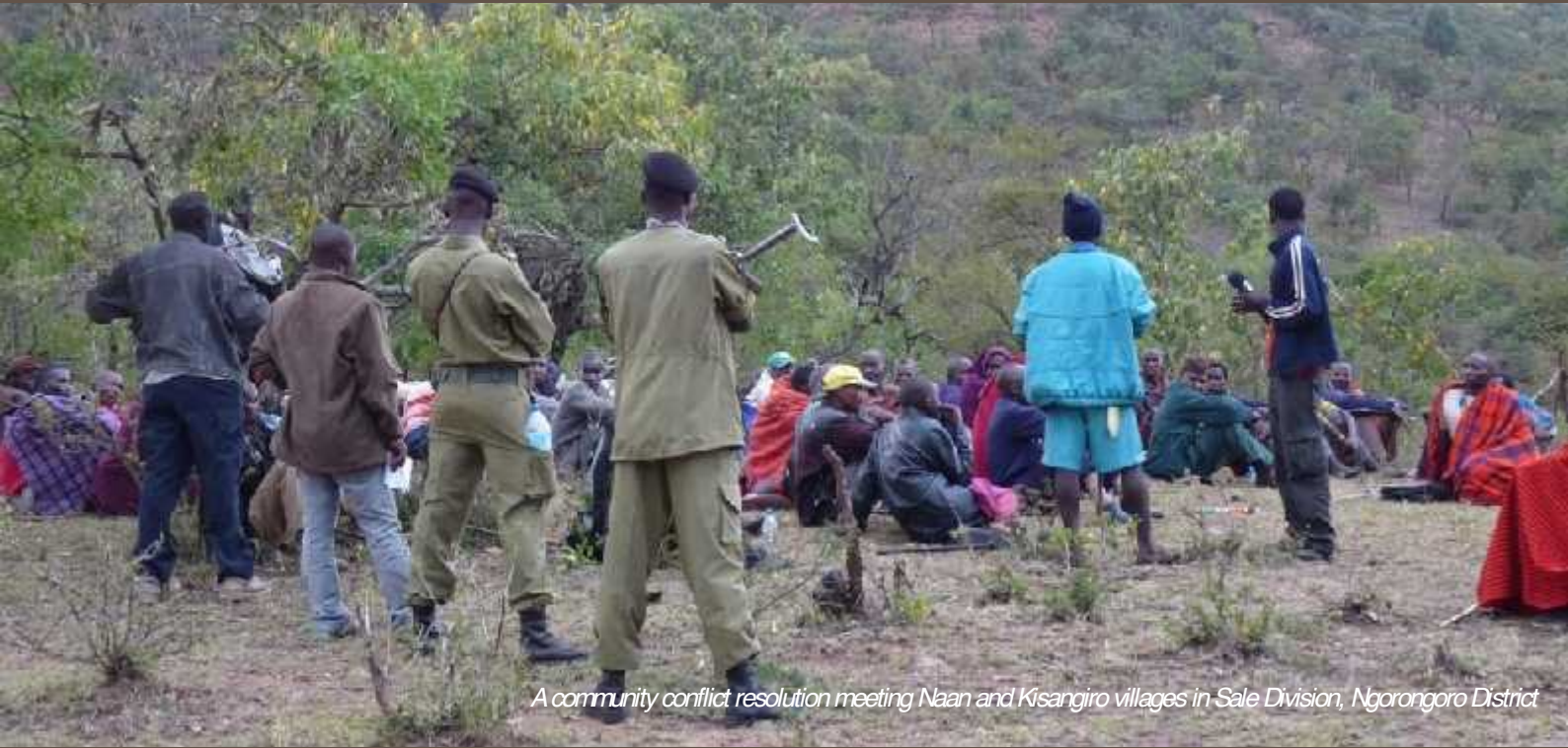
A community conflict resolution meeting Naan and Kisangiro villages in Sale Division, Ngorongoro District