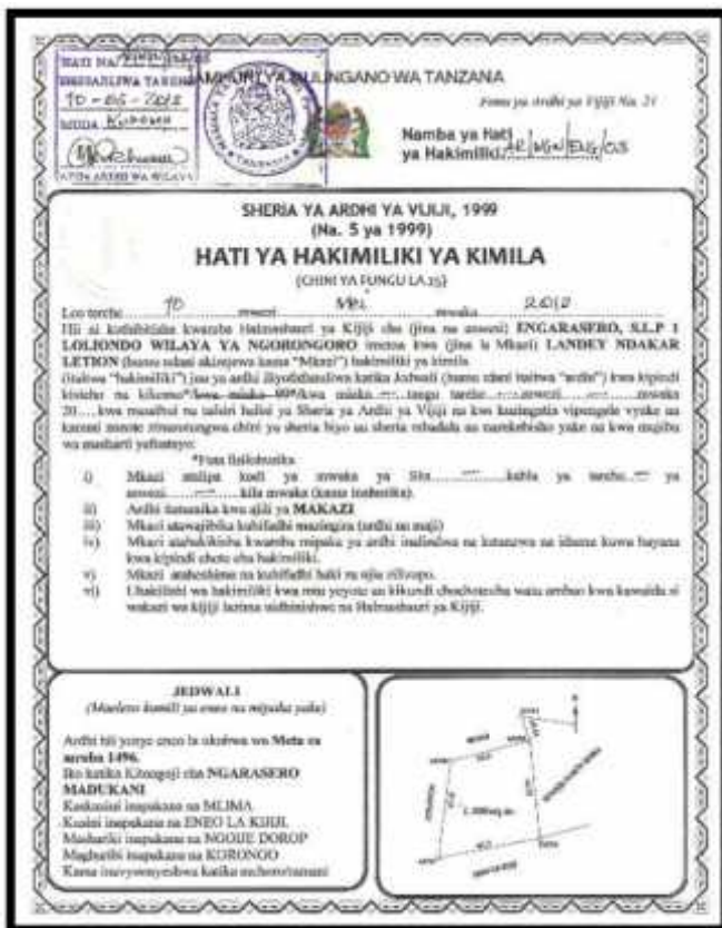
A community Customary Right of Occupancy Certificate

With all the necessary requirements in place, UCRT was able to assist the Hadzabe in applying for Group Certificates of Customary Right of Occupancy (CCROs), which allows the community to control, manage and have the right to sell or lease the land. UCRT assisted with this in each of the modern villages that cut across the Hadzabe's ancient domain.