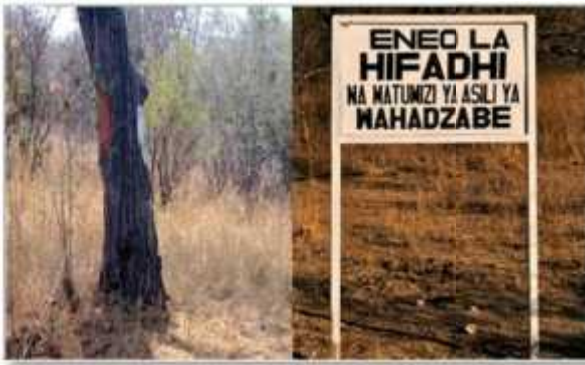
Old markers on trees and new metal signs protecting the area for the Hadzabe: a game of cat and mouse had started with some opportunistic individuals from a farming community cutting down marker trees, and marking new trees to shift the agreed boundary.

informed consent. The certification process is now close to completion through a rigorous standards system, known as Plan Vivo scheme. Community guards have been elected by the Hadzabe community to protect their area, and they are paid out of funds made available by Carbon Tanzania that will be deducted from the eventual carbon payments. This has enabled the Hadzabe to protect their boundaries from other communities, so that when other resource users want to use Hadzabe resources, they do so consensually and sustainably. The partnership between the Hadzabe and Carbon Tanzania, which was facilitated by UCRT, is working because the interests of each party are closely aligned. Carbon Tanzania's mission is to promote community-based conservation through incentives generated from the carbon market, and the Hadzabe are seeking ways that allow them to live in their last remaining wild lands indefinitely.