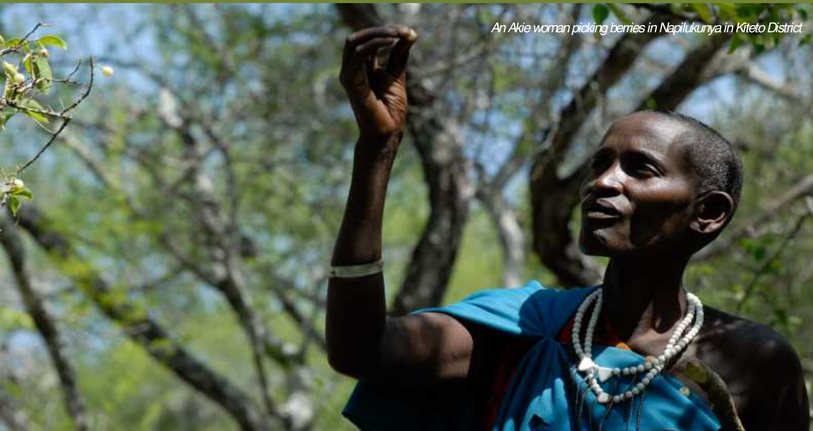
An Akie woman picking berries in Napilukunya in Kiteto District