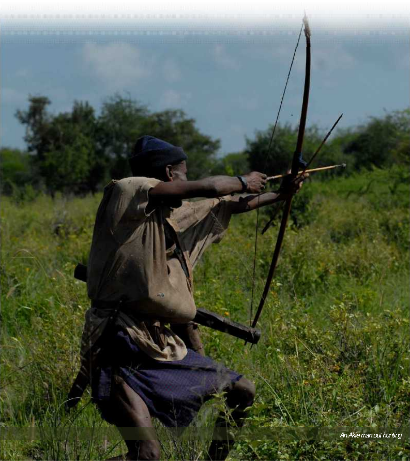
An Akie man out hunting

active in preventing the illicit sale of communal land and its fragmentation, thereby safeguarding the community's interests and their pastoralist livelihoods.