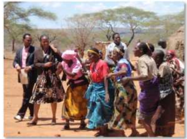
Hadzabe community welcoming the Assistant Commissioner of Lands when she came to award the Hadzabe their Certificates of Customary Rights of Occupancy.

by The Nature Conservancy, UCRT started building the capacity of the Hadzabe community, as well as the other surrounding farming and pastoralist communities in the area. Trainings were held on good governance and also on the relevant policies and laws of local government, land and wildlife. UCRT also facilitated the villages to obtain village land certificates, which included their developing simple sketch maps on how people used their lands for hunter-gathering, grazing, farming and settlements. After the initial land use planning was carried out a more formal plan was produced and village by-laws to compliment these were written and passed.