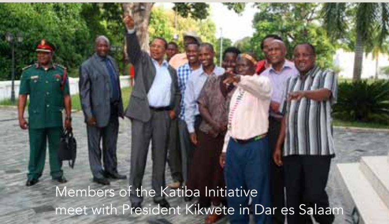
Members of the Katiba Initiative meet with President Kikwete in Dar es Salaam

The first and second drafts of Tanzania’s new constitution recognize the rights of minorities, in turn protecting the rights of pastoralists and hunter-gatherers (Article 45 first draft, article 46 second draft). UCRT participated in many initiatives to reform national policies to protect minority rights, including the Katiba Initiative, which is specifically aimed at strengthening minority rights in the new Constitution.